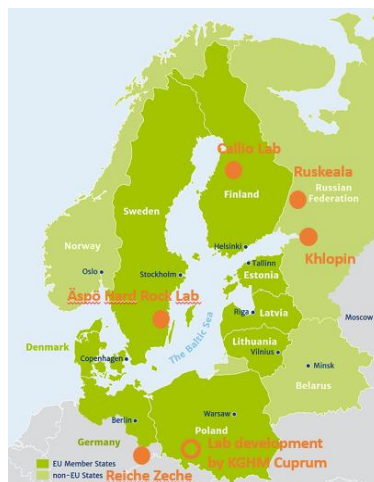
Fig 3. Map with denoted locations of underground locations involved in the BSUIN project.